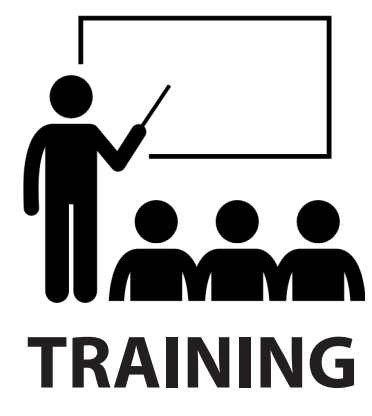
Train team members to recognize phishing and ransomware scams on email and phones.

Install and regularly update anti-virus and anti-malware software on all systems.