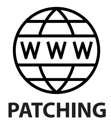
Install updates/patch operating systems, software, and firmware as soon as available.